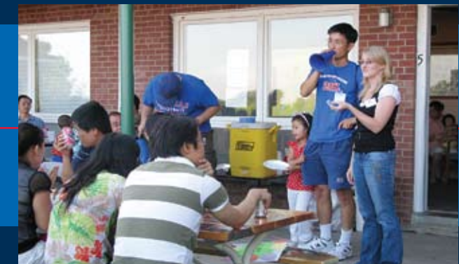
(Above) Stouffer Place hosts graduate students and families for cultural festivals and other fun programs. Anything grows in the community garden (top) including beautiful red peppers.

DEPARTMENT OF STUDENT HOUSING Contributing to Student Success